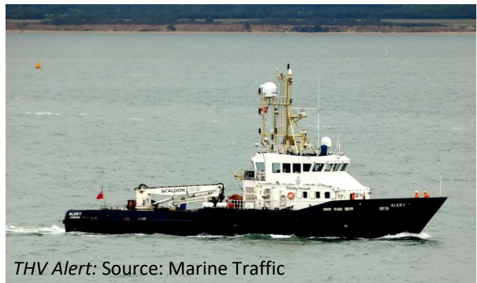
THV Alert

This chart shows the area where operations will be undertaken.