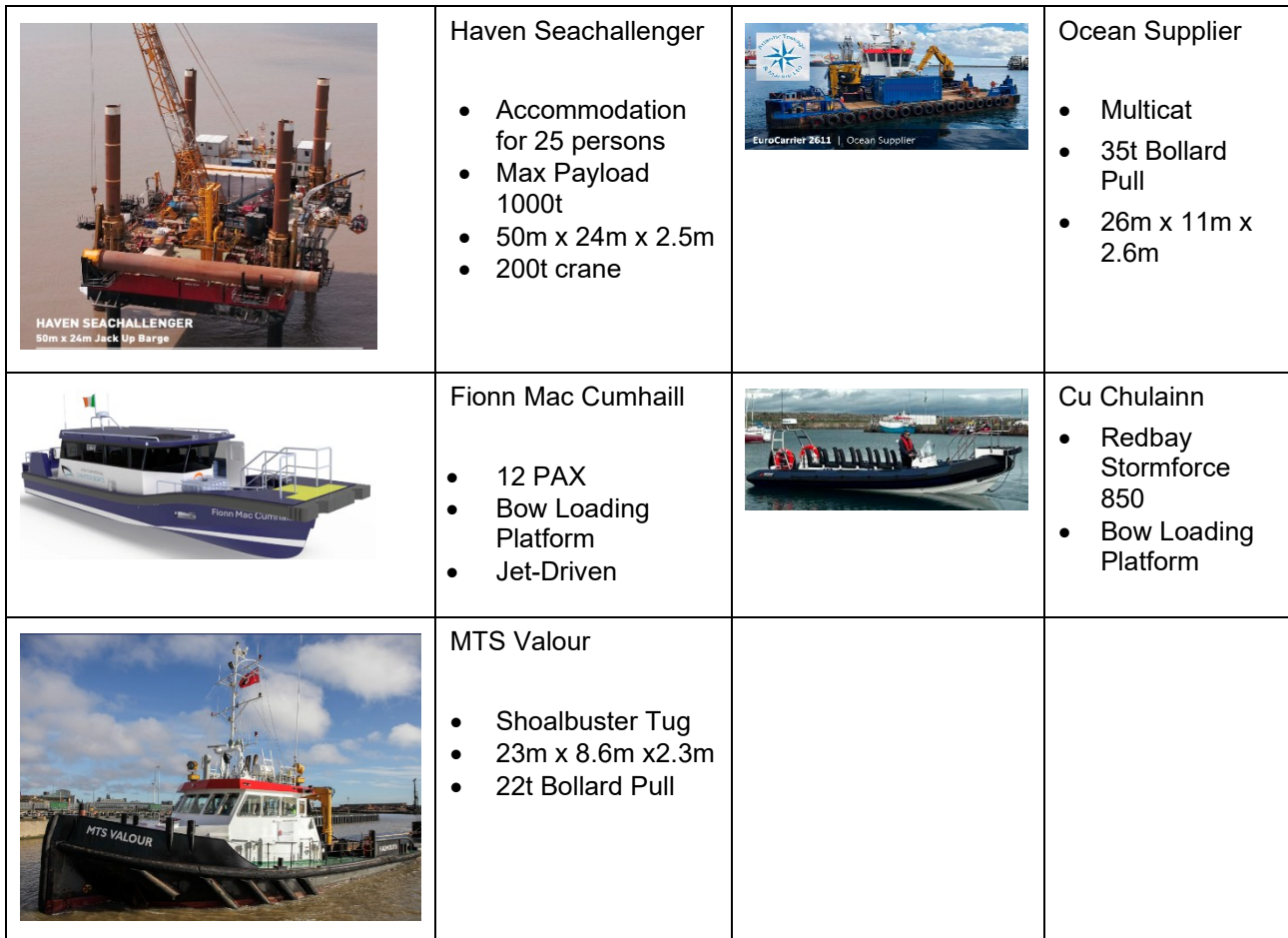
Figure 2: Marine plant involved in EA1N and EA2 marine works

Please note that there will be a number of occasions when the exclusion zone will need be extended and these events will be subject to additional Notices issued as required.